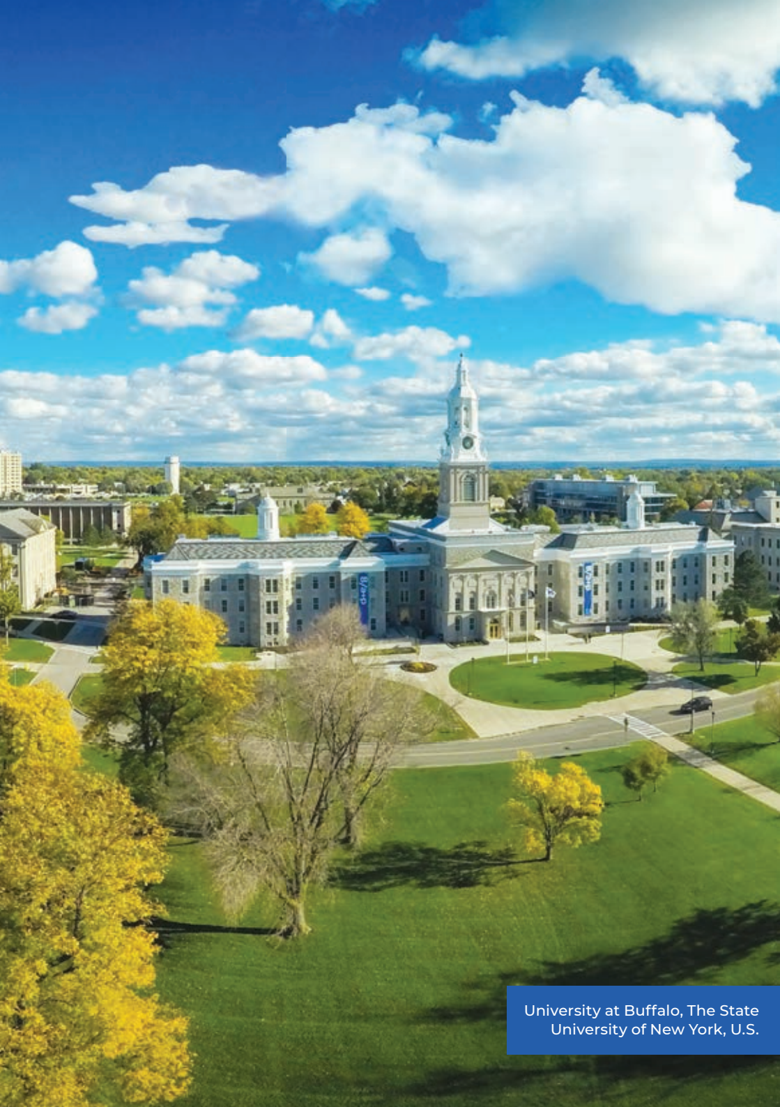
University at Buffalo, The State University of New York, U.S.