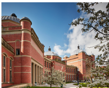
UNIVERSITY OF BIRMINGHAM birmingham.ac.uk