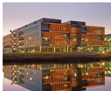
UNIVERSITY OF WOLLONGONG uow.edu.au CRICOS NO.: 00102E