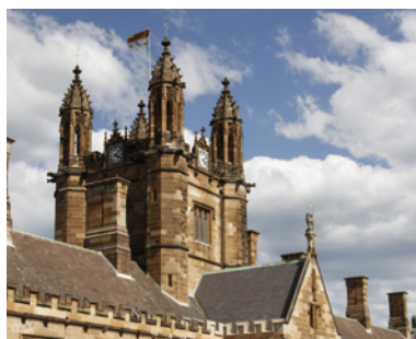
THE UNIVERSITY OF SYDNEY sydney.edu.au CRICOS No.: 00026A