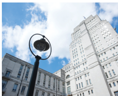
UNIVERSITY OF LONDON london.ac.uk