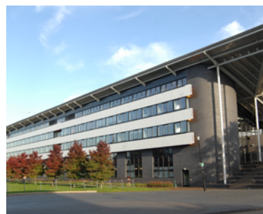
THE UNIVERSITY OF WARWICK warwick.ac.uk